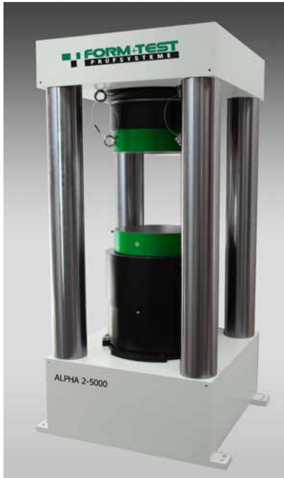
picture without protective grid