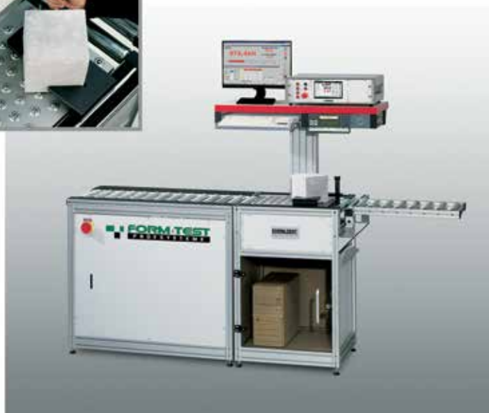
picture shows drive station MEWIS-C40-PC