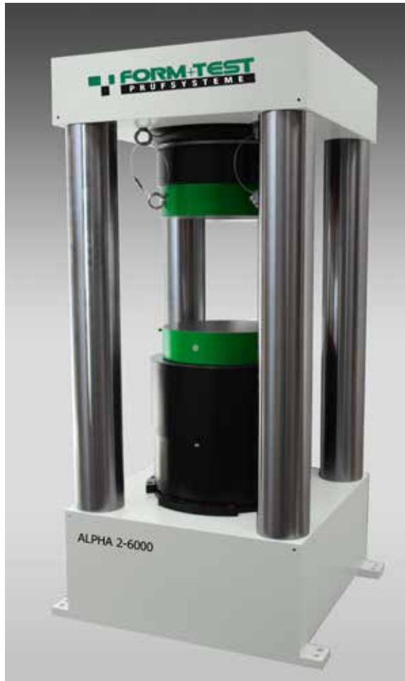
picture without protective grid